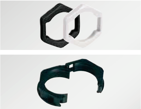
Type GMT: Split locknut, p. 346

Single-piece packaging units are available on request.