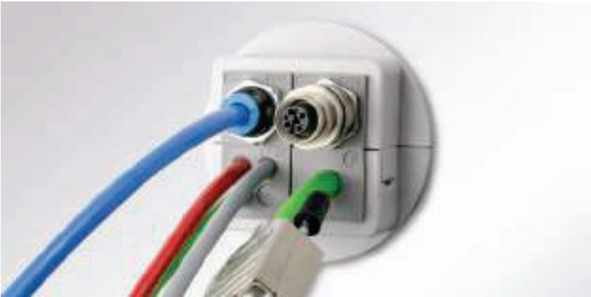
The cable glands enable the integration of the IMAS-CONNECT™ adapter grommets

1 1.11 1.12 1.13 1.14 1.15 1.2 1.21 1.22 1.23 1.24 1.25 1.3