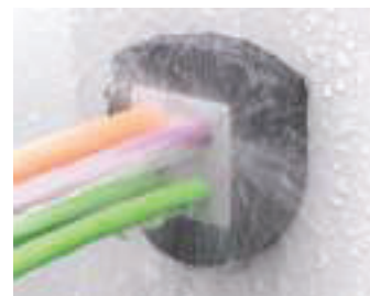
Certified protection class IP65/ IP66/IP67/IP68