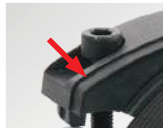
Injected elastomer gasket