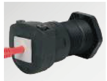
Can be combined with TE-M thread extension