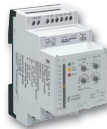
Residual current monitor RN 5883