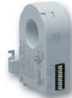
Residual current transformer ND 5015