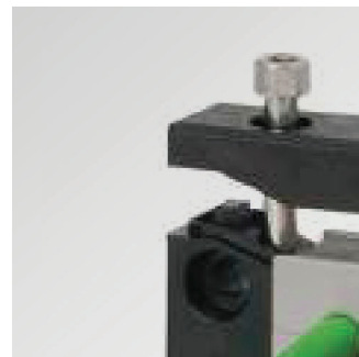
Also available with stainless steel screws (V2A)