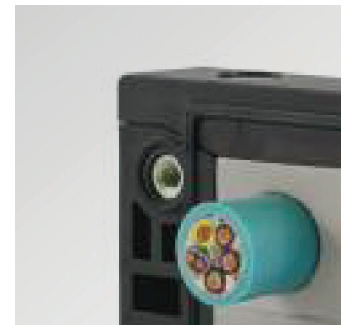
Also available with threaded bushings