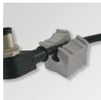
Split KT grommets