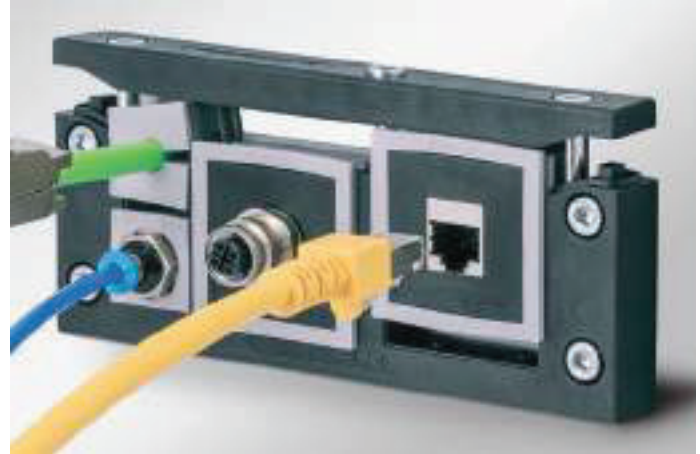
The cable entry frames enable the integration of the IMAS-CONNECT™ adapter grommets