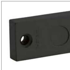
Also available in black.