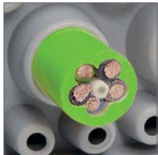
Conical shape on back provides additional sealing and strain relief